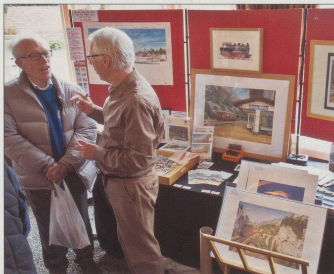
BELOW: Discussing art!