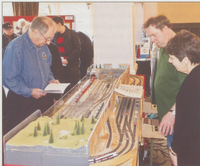
ABOVE: Layout watching.