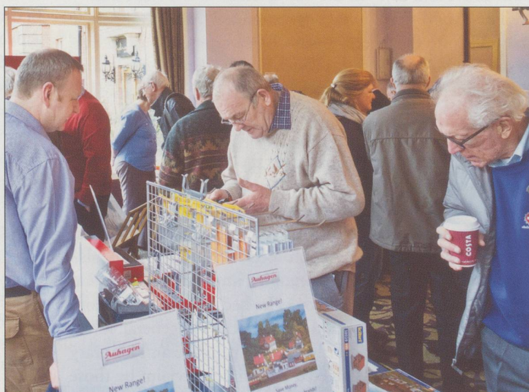
ABOVE: Right Priorities - coffee first then model buying.