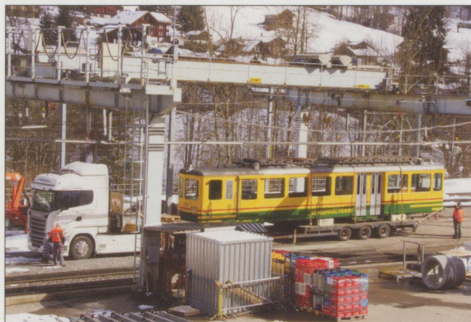
WAB 119 on low loader at Lauterbrunnen

At Lauterbrunnen on 5th March WAB BDhe 4/4 No.119, stripped of useful bits, was loaded onto a truck for its last journey - to the scrapyard. Nos.101, 107, 109, 119 and 124 are also taking this road, whilst No.102 was scrapped last year. No.109 was still in action at the station, but reprieves are short.