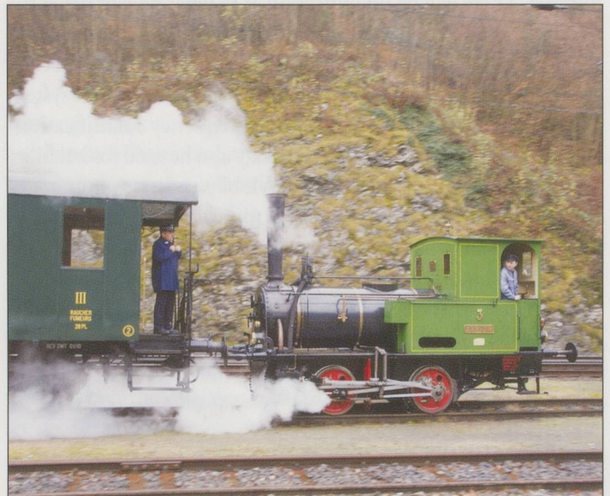
Locomotive 'Zephir' at Choindez station. (2)

Over the past winter SBB Historic has moved its archive and offices from Bern to Brugg. This move is planned to be celebrated in Brugg, together with 'Bahnpark Brugg', on 31st May when a programme of special trains will operate through the day with Eb 3/5 No.5819 from Brugg station. Also this year two more trips are planned using 1874-built E 2/2 'Zephir', a survivor of the Bödelibahn the first railway in Interlaken. These will be on 26th Sept. and 10th Oct. in conjunction with a conducted tour of the Delémont roundhouse of SBB Historic and Historische Eisenbahn Gesellschaft, and a return trip to Choindez for a visit to the Von Roll museum of the one-time ironworks located there. Your correspondent enjoyed a similar trip behind 'Zephir' last December.