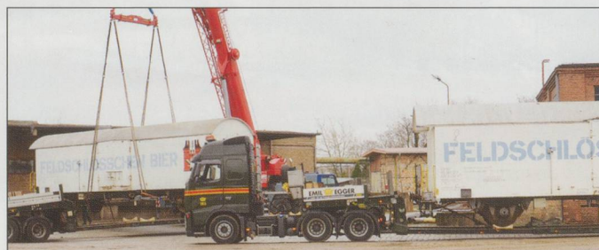
The wagons are unloaded from their road transport.