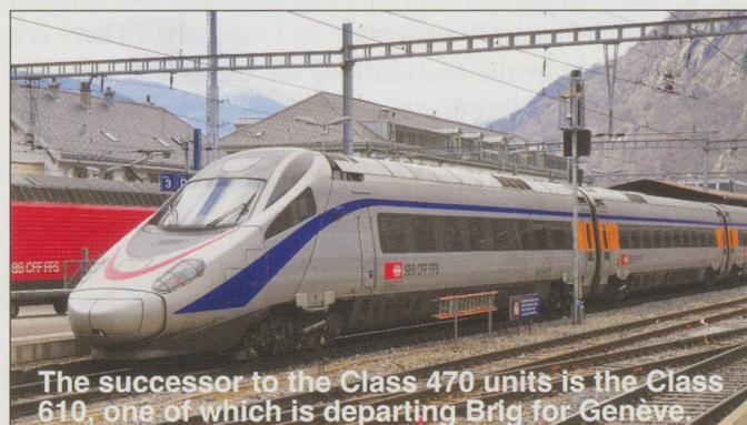
The successor to the Class 470 units is the Class 610, one of which is departing Brig for Genève.