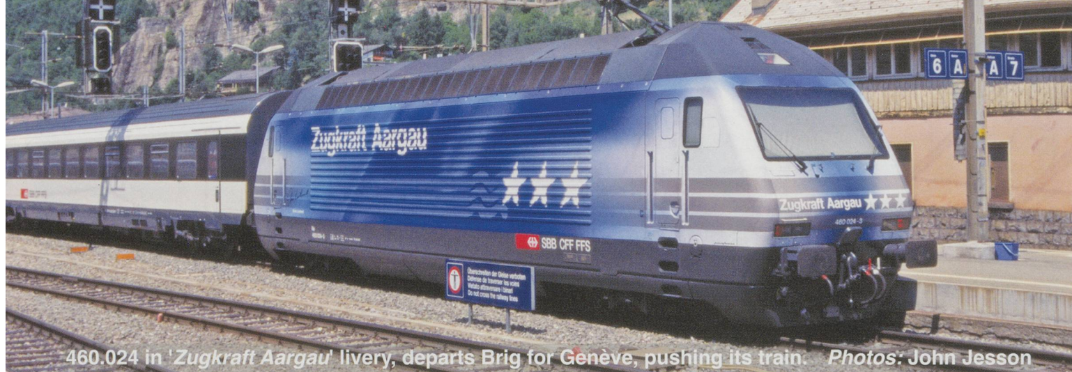
460.024 in 'Zugkraft Aargau' livery, departs Brig for Genève, pushing its train.

After the opening in 1906, traffic through the tunnel quickly built up and within a short time reached the capacity of the single line. In the middle of the tunnel, a crossing station had been established, staffed by two men, but it was realised that the only solution would be to open out the auxiliary tunnel to full dimensions.