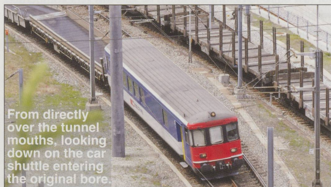
From directly over the tunnel mouths, looking down on the car shuttle entering the original bore.