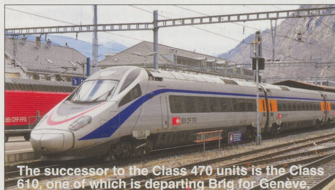
The successor to the Class 470 units is the Class 610, one of which is departing Brig for Genève.