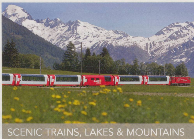
SCENIC TRAINS, LAKES & MOUNTAINS