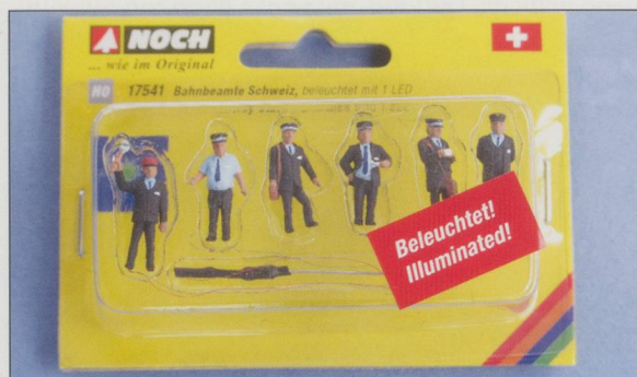
Swiss station personnel by Noch.