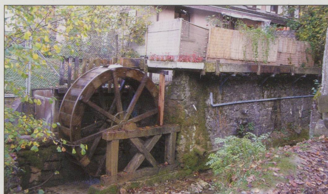
TOP: The tunnel at Reigoldswil.

Just above the cable car parking space, the entrance to the tunnel heading survives, something none of the visitors are probably aware of. It is full of water and extends just 60m into the hillside. A few paces away, across the stream and road, is a sawmill that was built by the SCB and its contractor, Schneider Münch und Jerschke, a German company. Work on the tunnel had started in 1874. In Reigoldswil 500 workers were recruited, English, German, French and Italian for the most. A boom set in, with lodgings, restaurants and tools, and a rapid rise in land prices. Many took credit to plan for the coming good fortune. In Mümliswil, the tunnel has collapsed, but the heading had been driven 1360m. Here some 300 were at work, and the scene was repeated. Then,