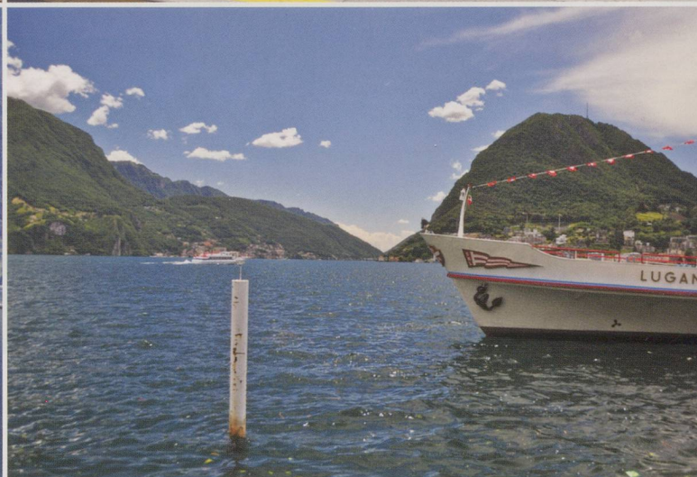
TOP: A scruffy Italian loco at Chiasso Station. BOTTOM: A boat tied up at Porlezza.