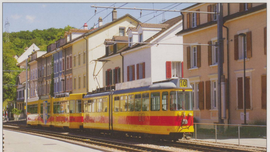
BELOW: BLT 1970s SWP articulated car 103 on the rear of double-articulated 216 near Münchenstein Dorf on Line 10 on 23 May 2014.