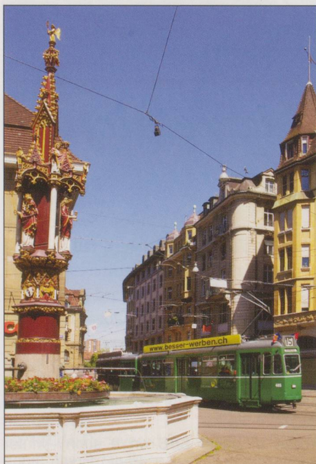
TOP: BVB Swiss Standards 457 + 1473 on Line 15 at Aeshenplatz on 23 May 2014. LEFT: BVB Swiss Standards 465 and trailer and the Fischmarkt fountain on 23 May 2014.