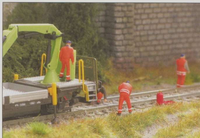
The Kibri unit comes with stabilisers that can be adjusted up and down.