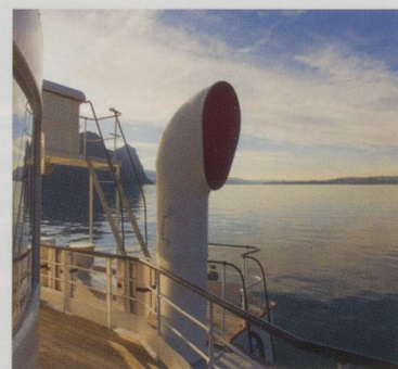
Glacier Express Packages - Tickets/Reservations Scenic Rail Journeys - Switzerland Tailor made Lakes & Mountains Experience Packages Ask for one of our brochures.