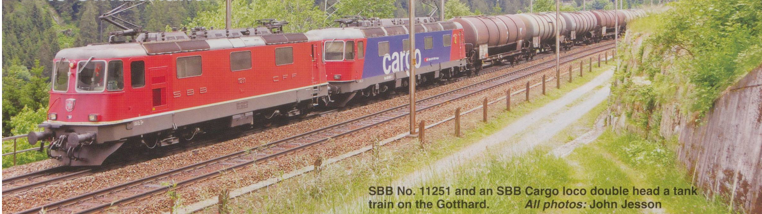
SBB No. 11251 and an SBB Cargo loco double head a tank train on the Gotthard.