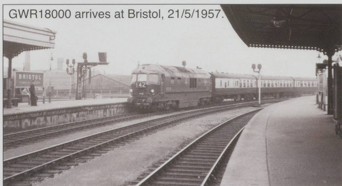
GWR18000 arrives at Bristol, 21/5/1957.