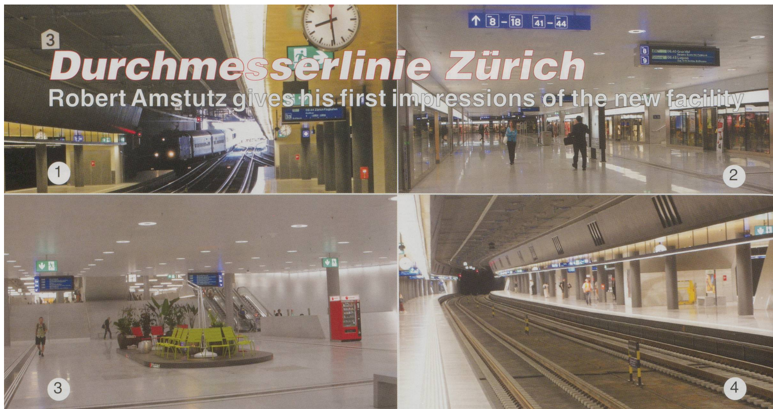
1. A train entering from Hardbrücke. 2. The shopping level. 3. The upper level. 4. View in the direction of Oerlikon/Winterthur. The track rises slightly along the length of the platform before plunging into the tunnel.