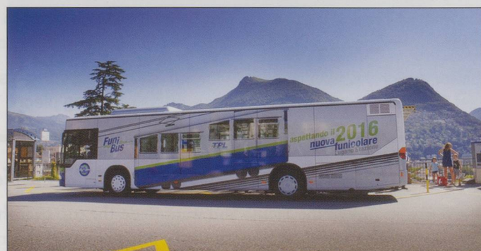
TOP: Car No. 1 is lifted out. MIDDLE: Car No. 1 at the top in the SBB station concourse. BOTTOM: The replacement bus service.