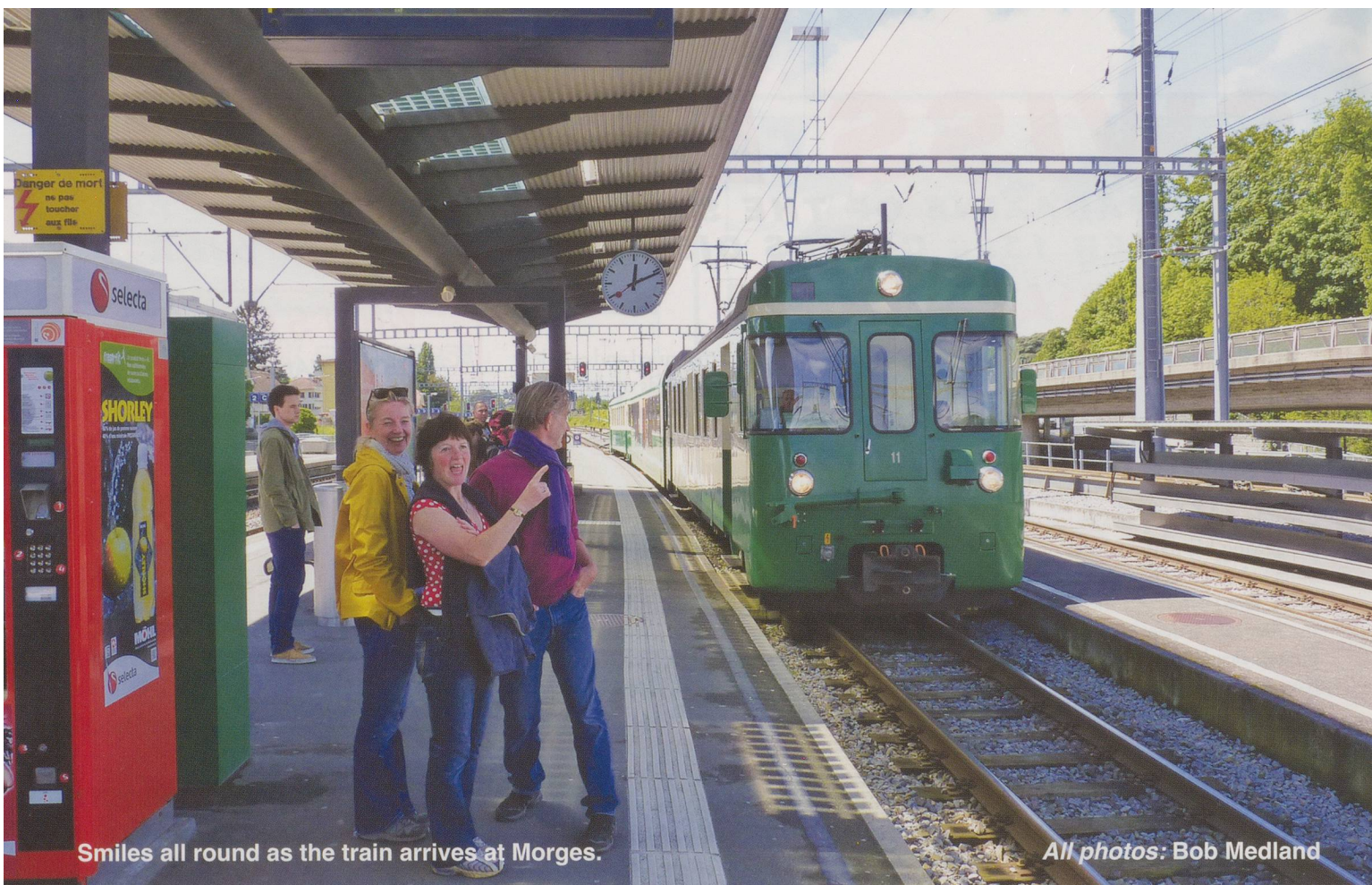
Smiles all round as the train arrives at Morges.