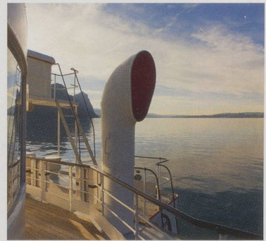
Glacier Express Packages - Tickets/Reservations Scenic Rail Journeys - Switzerland Tailor made Lakes & Mountains Experience Packages Ask for one of our brochures