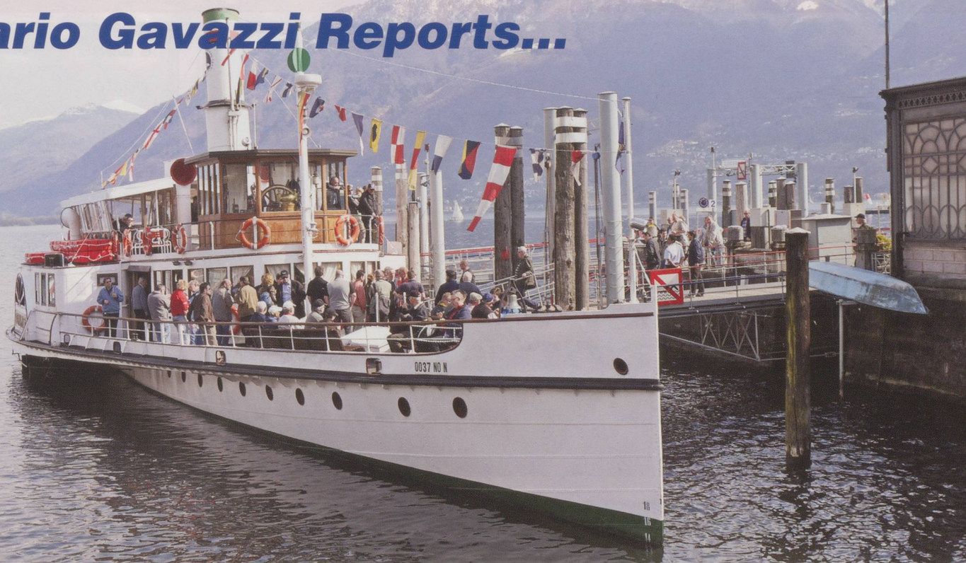
110 years old, but very fit, P/S 'Piemonte'.