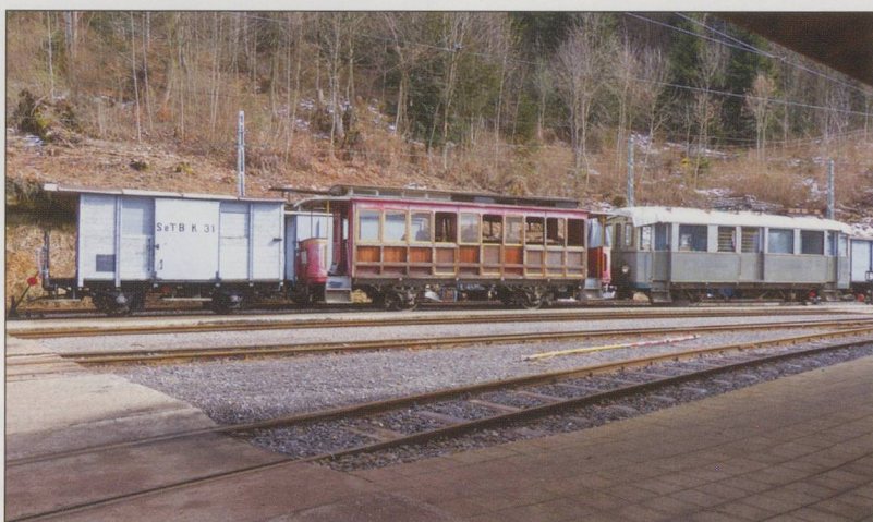
TOP: The first step of the current shed renewal with the rather awful Eternit cladding replaced by a much better suited wood front. Expensive, but a real improvement to the whole area. In front of it some long running "work in progress", the Sernftalbahnhof set, which is next in line for refurbishment.