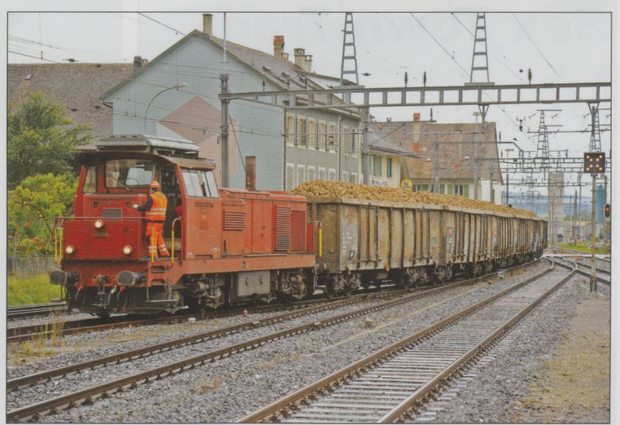
TOP: SBB Class Em 3/3 18818 was allocated to the Avenches sugar beet duties when recorded in October 2010.

MIDDLE: The newly commissioned sugar beet loading site at Domdidier, October 2012.