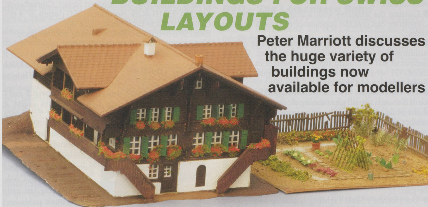
An Emmentaler farmhouse (a plastic kit by Kibri) with a handmade garden along side.

Peter Marriott discusses the huge variety of buildings now available for modellers