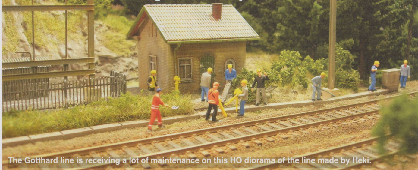
The Gotthard line is receiving a lot of maintenance on this HO diorama of the line made by Heki.

T he number and variety of accessories that are now available for model railways in all of the popular scales is enormous. There are detailing parts in plastic, in resin, in white metal and other materials. Some come ready assembled and painted, others arrive in unpainted form or as a kit. New products are being introduced constantly.