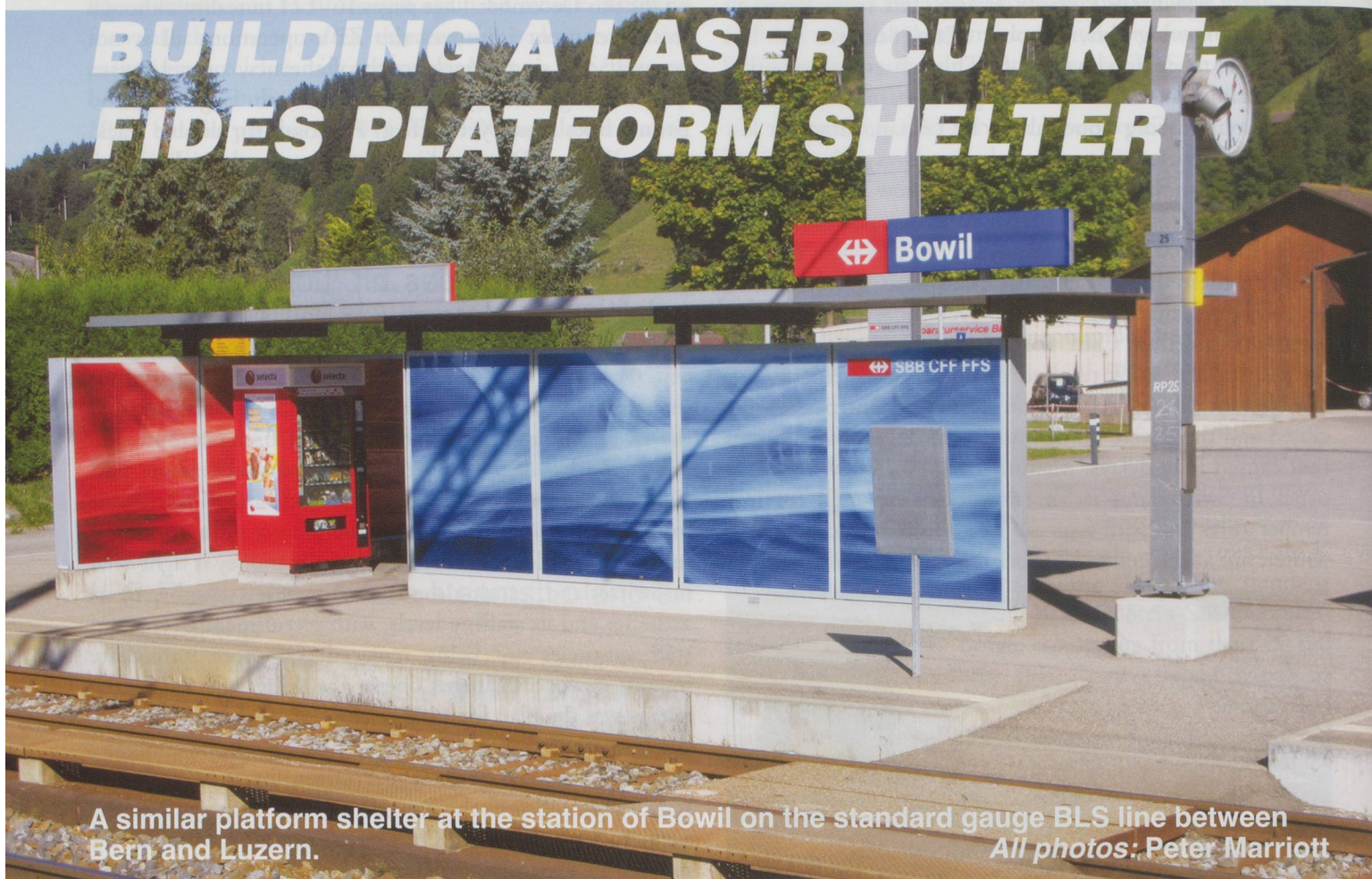
A similar platform shelter at the station of Bowil on the standard gauge BLS line between Bern and Luzern.