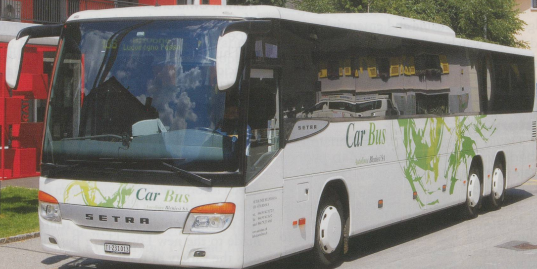
Three axle Setra at Olivone.