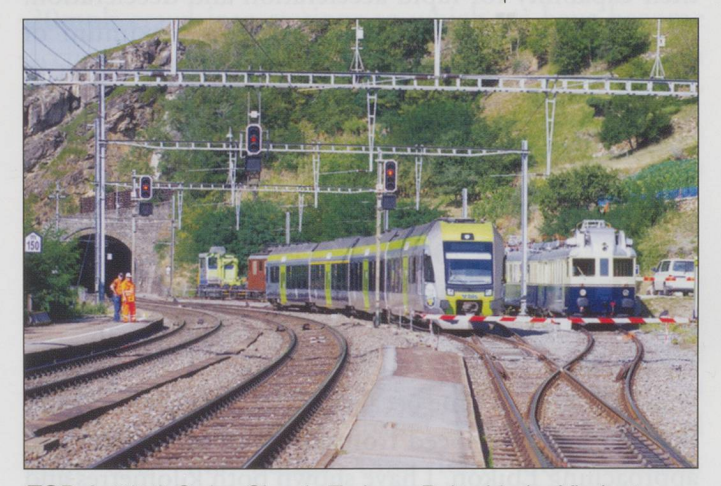
TOP: Ae6/8 & Swiss Classic Train on Baltschieder Viaduct. MIDDLE: BN Be4/4 at Hohtenn. BOTTOM: 'Lötschberger' & 'Blauen Pfeil' on display at Ausserberg.

through restoration, BLS Ae8/8 No. 273 and current BLS permanent way department No. 235 206. There were also events in the centre of Ausserberg, far enough away from the station to justify a PTT mini-bus shuttle.