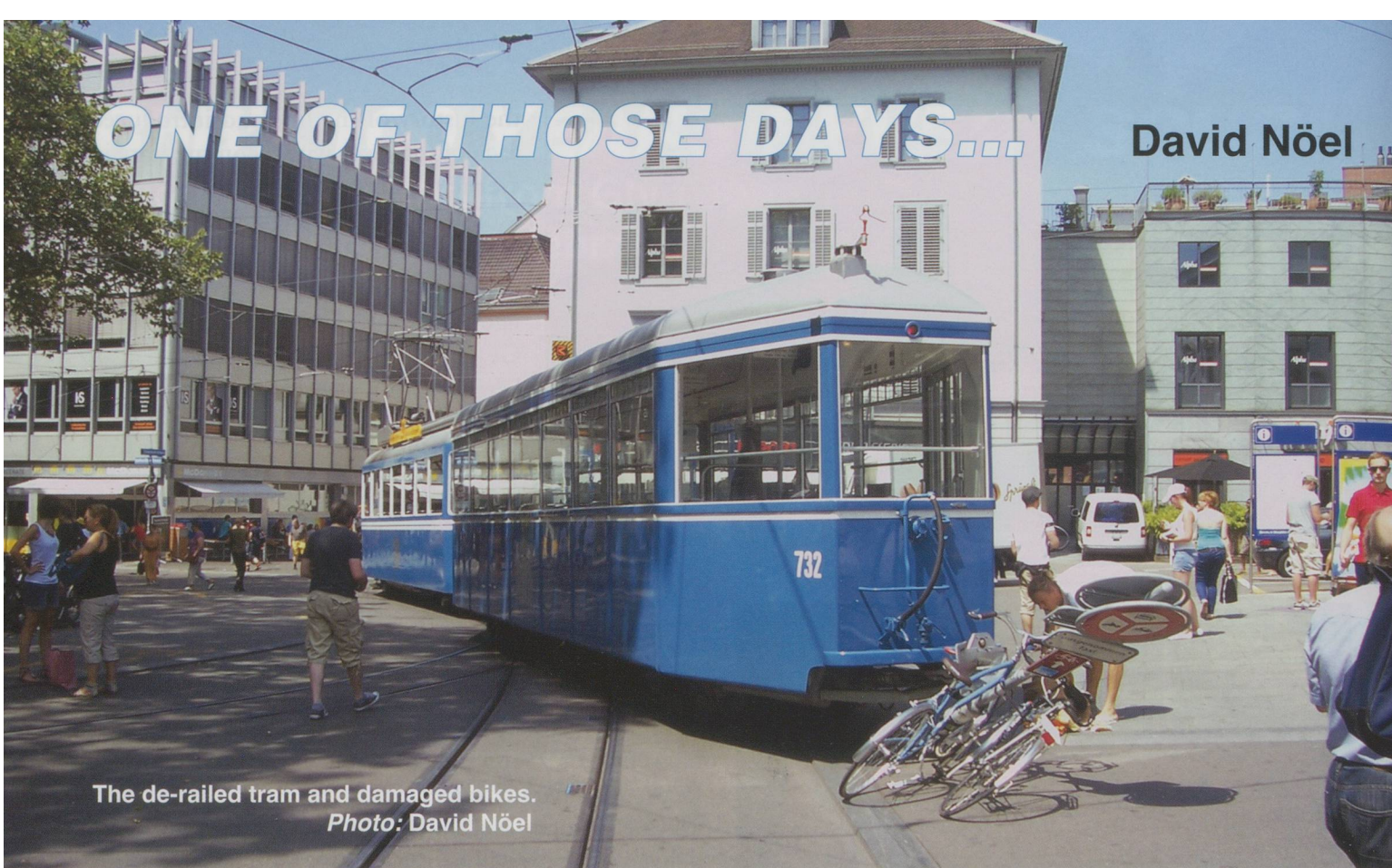
The de-railed tram and damaged bikes.