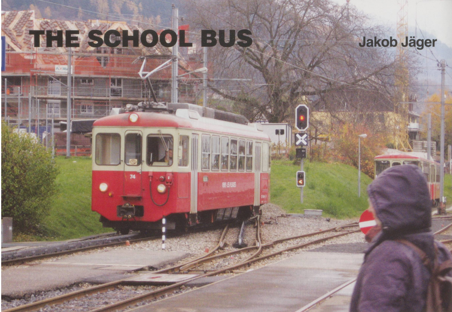
BDeh 2/4 No. 74 arrives at Blonay from Les Pléiades.