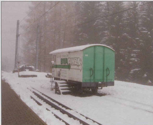
BELOW: Going home.