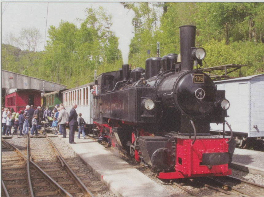
ABOVE: Ex-Zell-Todnau G2 x 2/2 105 waits to take another load of happy holidaymakers on the scenic trip to Blonay.