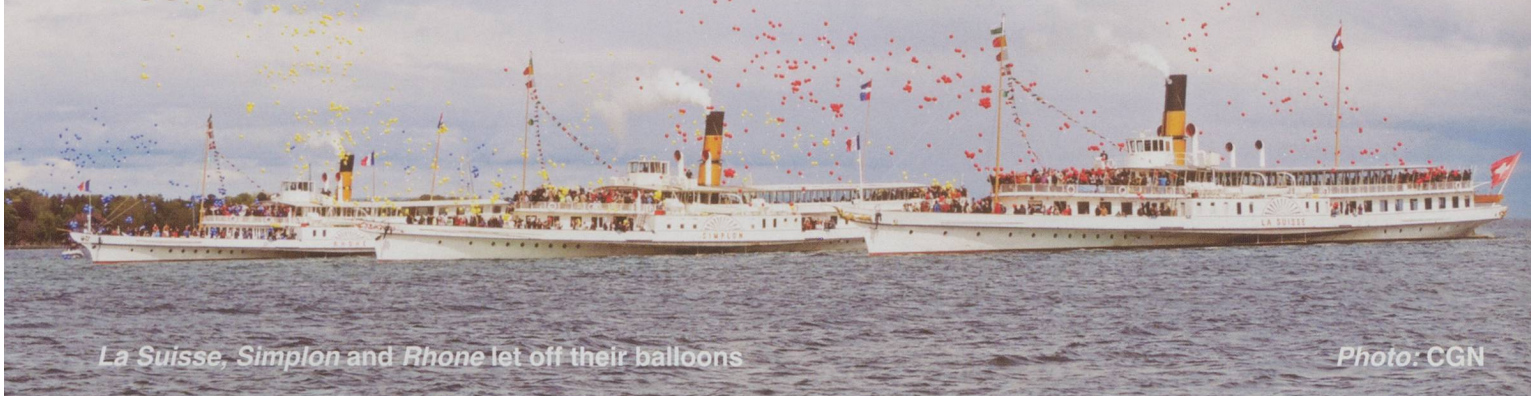
La Suisse, Simplon and Rhone let off their balloons