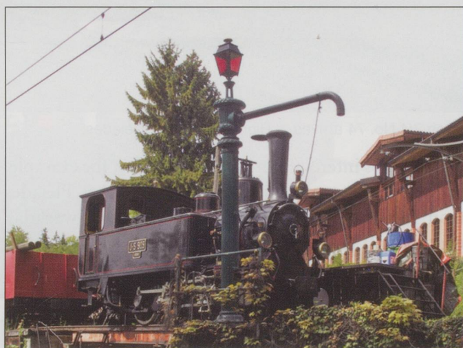
BELOW: Former Jura-Simplon G3/3 loco No. 909 replenishes its coal stocks at the bifurcation near Chaulin Museum.