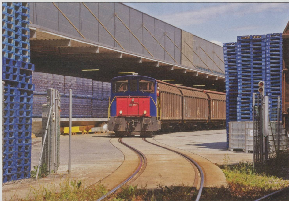
ABOVE: Having arrived with a train of empty vans, SBB Cargo Tm 232 226 was being coupled to the rake of loaded vans to be removed from the Rauch Trading AG premises at Widnau.

This lunchtime Red Bull departure from St Margrethen to Singen and beyond was recorded at Rorschach behind DB 185 094 in June 2012.