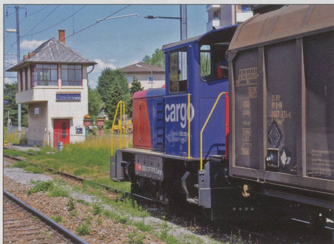
BELOW: The disused signal cabin at Heerbrugg marks the junction of the short freight only branch to Widnau. The mid-afternoon working of loaded vans waits for a path north to St Margrethen.