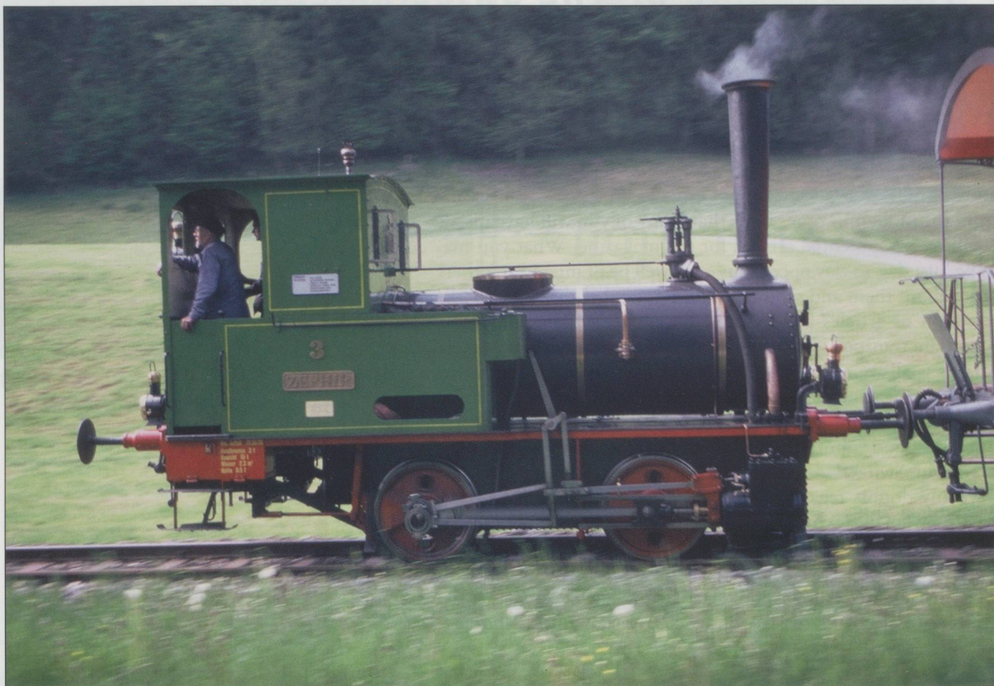
'Zephyr' at Wasen im Emmental in 1998.