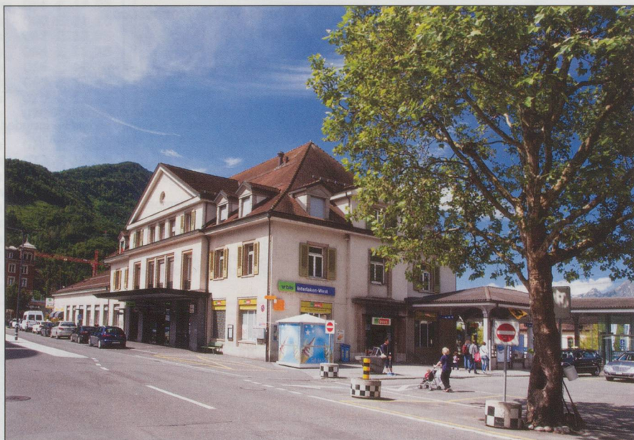
The Bahnhofstrasse approach to Interlaken West station.

nothing to them, will know it. It was the first railway in the Bernese Oberland, and it is a tragic-comic story. The Bödeli is the local name for the isthmus on which Interlaken stands - the post ice-age deposit between the Thunersee and Brienersee formed by the Lütschinen river. In the 19thC Interlaken enjoyed an unprecedented