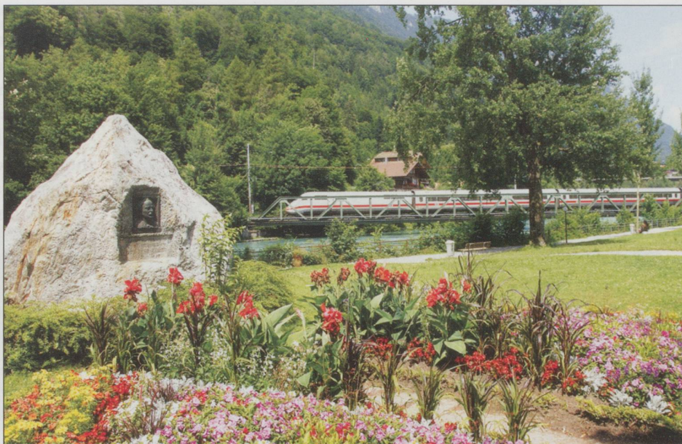
A DB ICE service crosses one of the bridges over the Aare canal, seen from the adjoining gardens.

on the Brienzersee. With hindsight that was a mistake, although understandable as the plans were to build a railway from Bönigen up to Lauterbrunnen. The Aare-canal access was however improved as far as the Zollbrücke (today's Interlaken Ost), enabling the steamers and the railway to Lauterbrunnen to start there. The Bönigen branch became an incubus, undermining the receipts, and Bönigen an idyllic corner, though the BLS still has a workshop there.