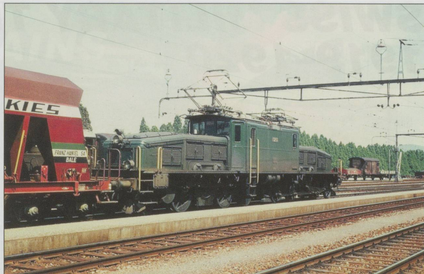
TOP: No.13256 at Stein-Säckingen 1969.