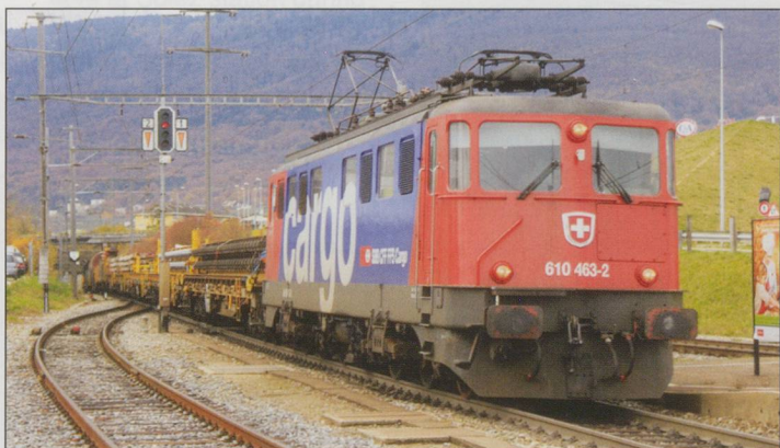
610 463 heads east through Marin Epagnier with the afternoon trip to the Vigier concrete sleeper works at Muntschemier.