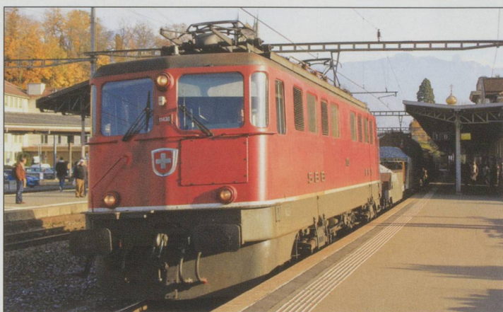
11430 rumbles through Vevey station with the afternoon St Maurice – Denges freight.