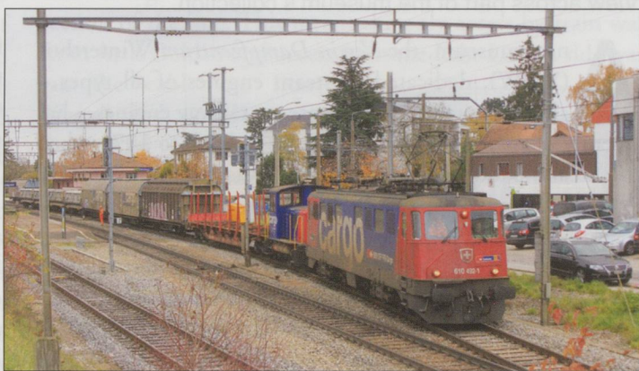
610 492 prepares to leave Marin-Epagnier with the afternoon trip freight back to Neuchâtel yard.