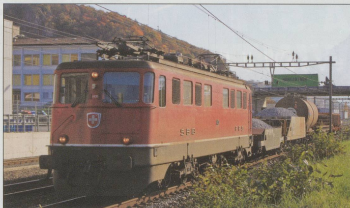
11430 passes Aigle with the afternoon St Maurice – Denges freight.