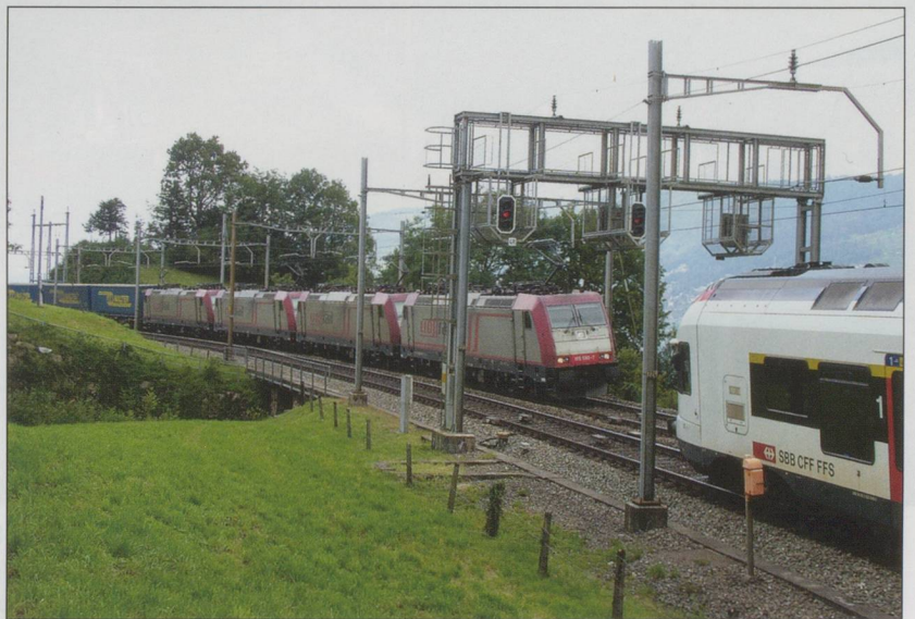
TOP RIGHT: Two DB locos on a freight.