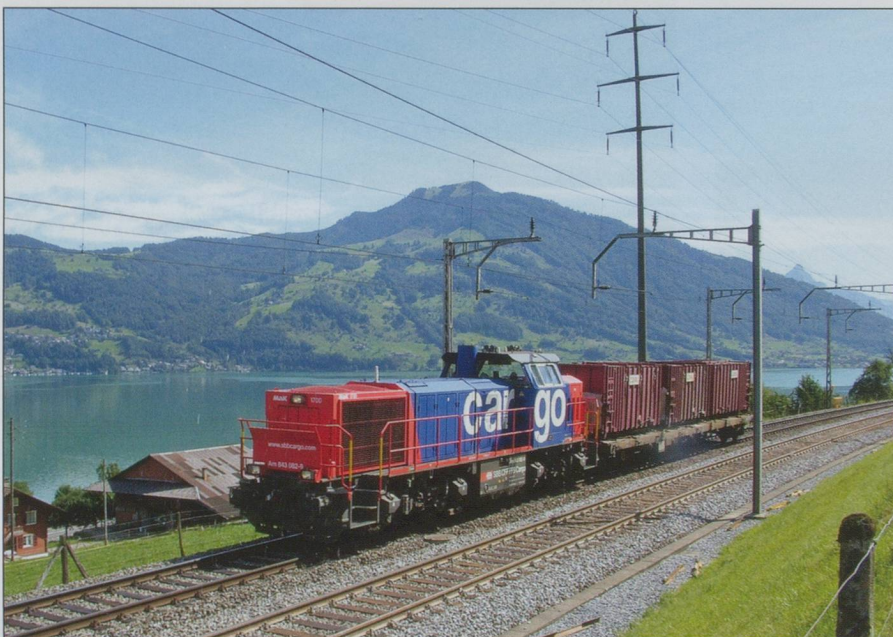
A Cargo diesel with a “heavy” load.

Alighting at the station turn right and walk beside the sound barriers towards the village, joining the main road as you go. Turn right again, walk under the railway and the Motorway, passing the graveyard and Church, until you come to a minor road on your right signposted Arth. Take this, then it is a 30 minute walk with the lake to your left to the point it is signposted “Cul de sac” and “Cycle Route 77”. Then you have a choice. Turning right takes you under the Motorway up a short hill then to a left-turn onto the old Immensee-Arth road. Follow this for some 500m until you come to a farm, then a house with a rockery (complete with a white seated statue and a blue gnome), where a small road on your right leads up the hill, under the railway. Turn right here for Location A and left for Location B. Alternatively keep to “Cycle Route 77” alongside the lake, pass some lovely gated houses, and follow the sign “Schattenberg – 50min.” and “Arth 1hr 45min.” This will lead you under the Motorway, and following “Wanderweg” a short uphill path across a field takes you under the railway where