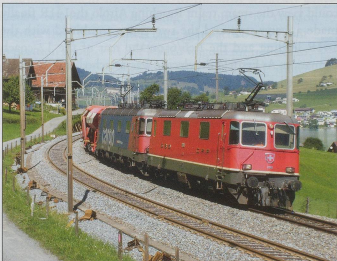
BELOW LEFT: SBB CARGO combo on a freight.