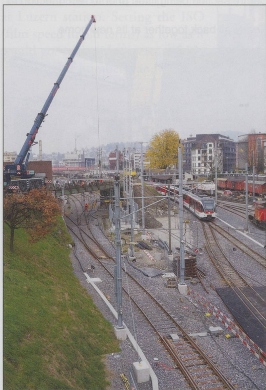
BELOW: ZB train calling at Allmend Messe.