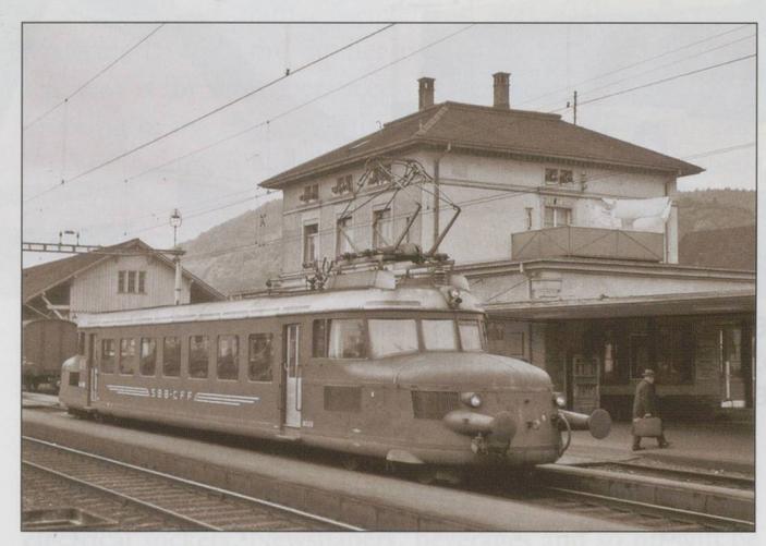
Red Arrow at Bad Zurzach in 1965.

Finally, another curiosity. Until the 1970s, a regular weekday service used to run between Zürich HB and Bad Zurzach, the stock spending several hours at either Bad Zurzach or Koblenz. My 1971 Kursbuch records these trains leaving Zürich at 08.09 and 13.19 and returning at 10.54 and 16.14 both services taking the route via Eglisau. Often it was operated by a 'Roter Pfeil', one of the seven Rae2/4 'Red Arrow' single railcars built for the SBB in the 1930s.