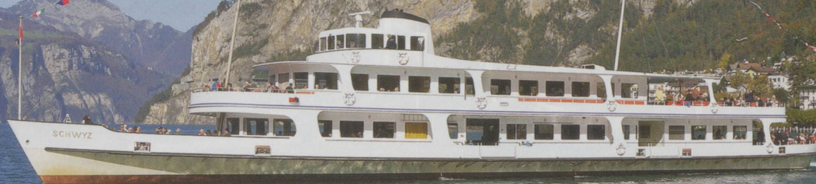
MS Schwyz seen leaving Flüelen on Sunday October 21st. 2012.