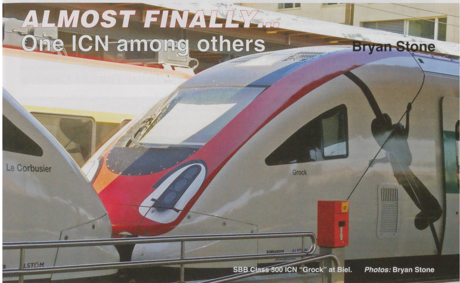
SBB Class 500 ICN "Grock" at Biel.