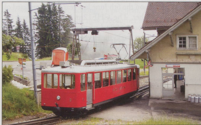
ABOVE: No 3 at Kaltbad - 21.06.09.

Special offer for SRS Members. If you would like the new 2012 Rigibahnen guide book, email your SRS Membership Number, name and full postal address with post code to info@rigi.ch . The book will be sent to you together with an exclusive Rigi Chocolate bar! This is in the form of Rigenbach's rack rail. This offer is valid until 31st May 2012, and is limited to one application per member.