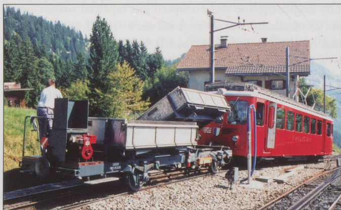
BELOW: Rigi No. 5 tipping building material at Kaltbad.