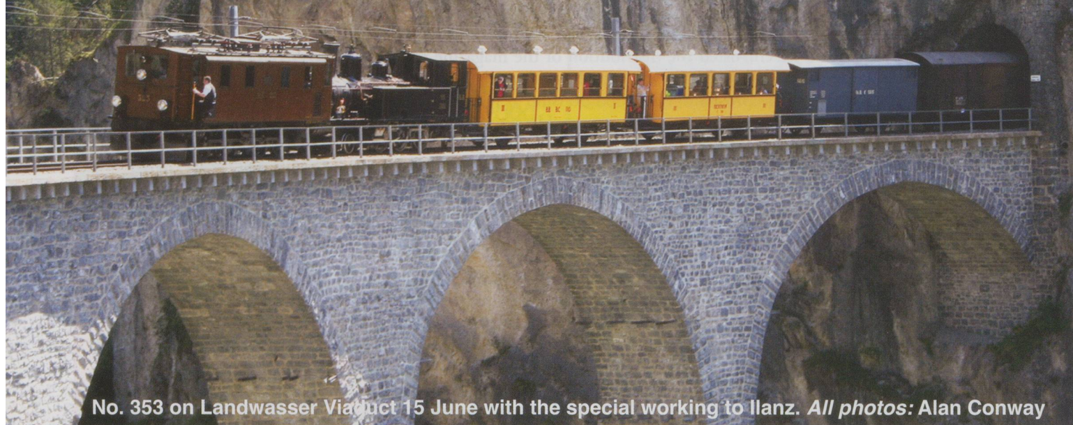
No. 353 on Landwasser Viaduct 15 June with the special working to Ilanz.

The weekend of the 16th/17th June saw the RhB celebrate 100 years of the line from Chur to Disentis/Mustér. Prior to the weekend we based ourselves at Samedan, wanting to seek out any ABe 4/4 II railcars still operating on the Bernina line. We also visited the new Bergün Railway Museum - highly recommended for anyone interested in the RhB. Returning to Bergün station, an "Extrazug" to Reichenau-Tamins was being advertised. This comprised Ge4/6 No.353 hauling RhB steam locomotive No.11, two vintage coaches (BC 110 and C 114) and assorted freight wagons. We boarded, only to find we had joined a private charter train! A fare was negotiated and we enjoyed a fantastic trip to Reichenau-Tamins. Ge2/4 No.222 then took the train to Ilanz, where the complete train was on display for the weekend. The fare we paid was worth every penny as it included a photo stop on the Landwasser viaduct where we were all allowed to get off and photograph the train which then came round to pick us up. We wondered what British 'Health and Safety' would have made of this.