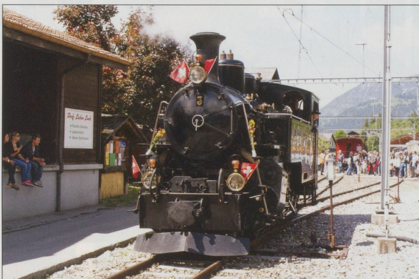
Top: FO HG 3/4 No 3 climbing the Lenk Valley.