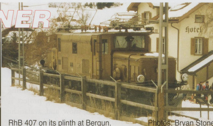
RhB 407 on its plinth at Bergun.

On 15th October 2011 the SRS was invited to be represented at the opening of the SBB Historic collection and workshops in the former SBB work's facility in Olten. The opening was great fun, with speeches, a band, an Apéro, and some lunch, but it showed the dramatic achievement of rebuilding two large halls, and a former transporter bridge area, as a workshop and display area for the main collection. Participants also had a free ride with Ae6/6 No.11425 to Oensingen and back, where JS Eb2/4 No.35 and SCB Ed2x2/2 No.196, kept at Balsthal, were in steam on the OeBB. Olten is a railway town, and the city authorities are also supporting the depot. The intention is that it should be