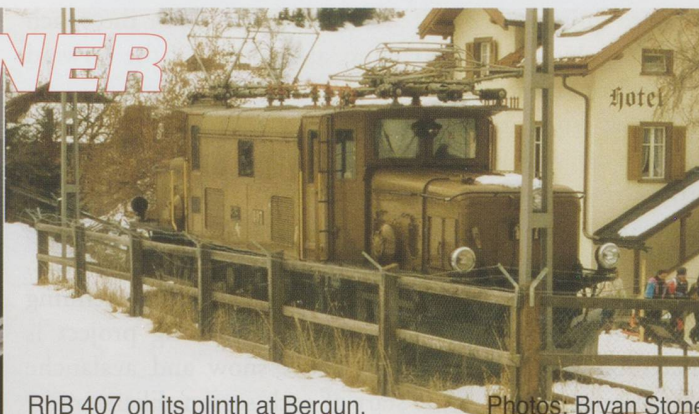
RhB 407 on its plinth at Bergun.

On 15th October 2011 the SRS was invited to be represented at the opening of the SBB Historic collection and workshops in the former SBB work's facility in Olten. The opening was great fun, with speeches, a band, an Apéro, and some lunch, but it showed the dramatic achievement of rebuilding two large halls, and a former transporter bridge area, as a workshop and display area for the main collection. Participants also had a free ride with Ae6/6 No.11425 to Oensingen and back, where JS Eb2/4 No.35 and SCB Ed2x2/2 No.196, kept at Balsthal, were in steam on the OeBB. Olten is a railway town, and the city authorities are also supporting the depot. The intention is that it should be