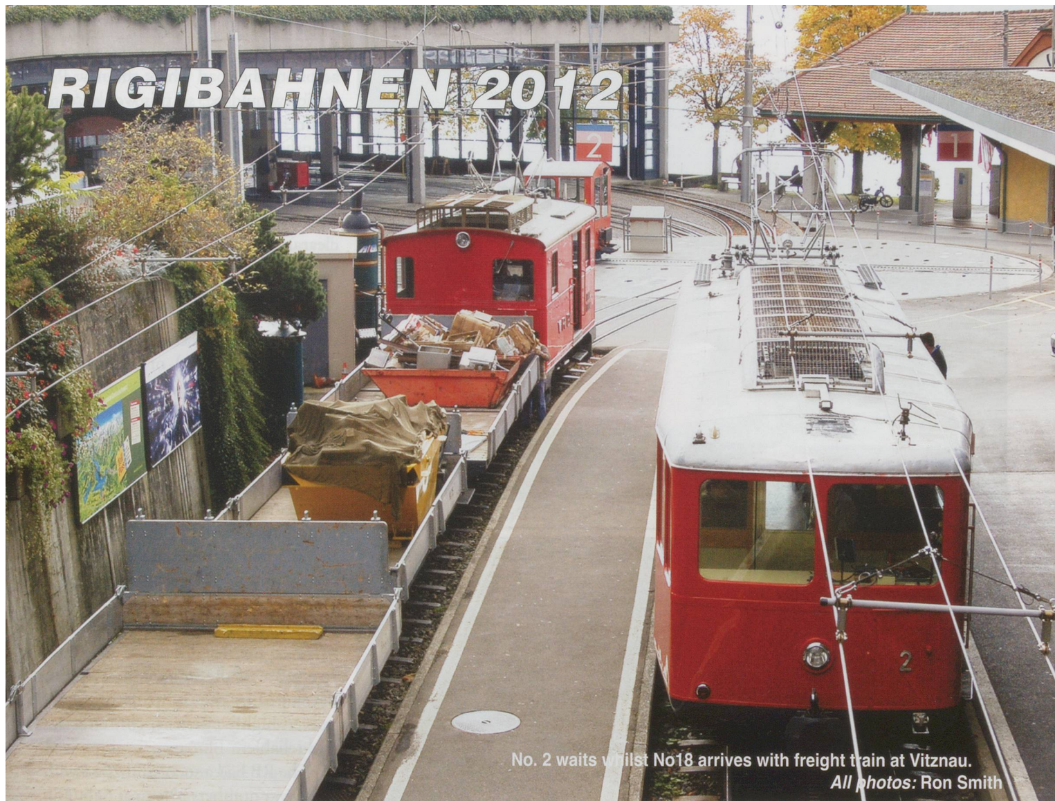
No. 2 waits whilst No18 arrives with freight train at Vitznau.