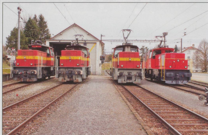
Line up at Bonfol of the shunters new to the CJ.

The company have taken on standard gauge shunting duties at Tavannes from SBB Cargo, thus ensuring that goods traffic can continue on the narrow gauge. To achieve this, they have bought Ee3/3 9 from PTT to join Ee 936 151/2 (PTT 11/10), acquired in May and September to work chemical waste traffic between Bonfol and Porrentruy. No. 9, renumbered Ee 936 153, has been sent directly to workshops to be fitted for multiple operation and cab signalling for use at Bonfol; as only 936 151 was so fitted on purchase, and 936 152 has been sent to cover the Tavannes diagram pending later modification, Ee3/3 14 has been hired from PTT to cover the second diagram at Bonfol.