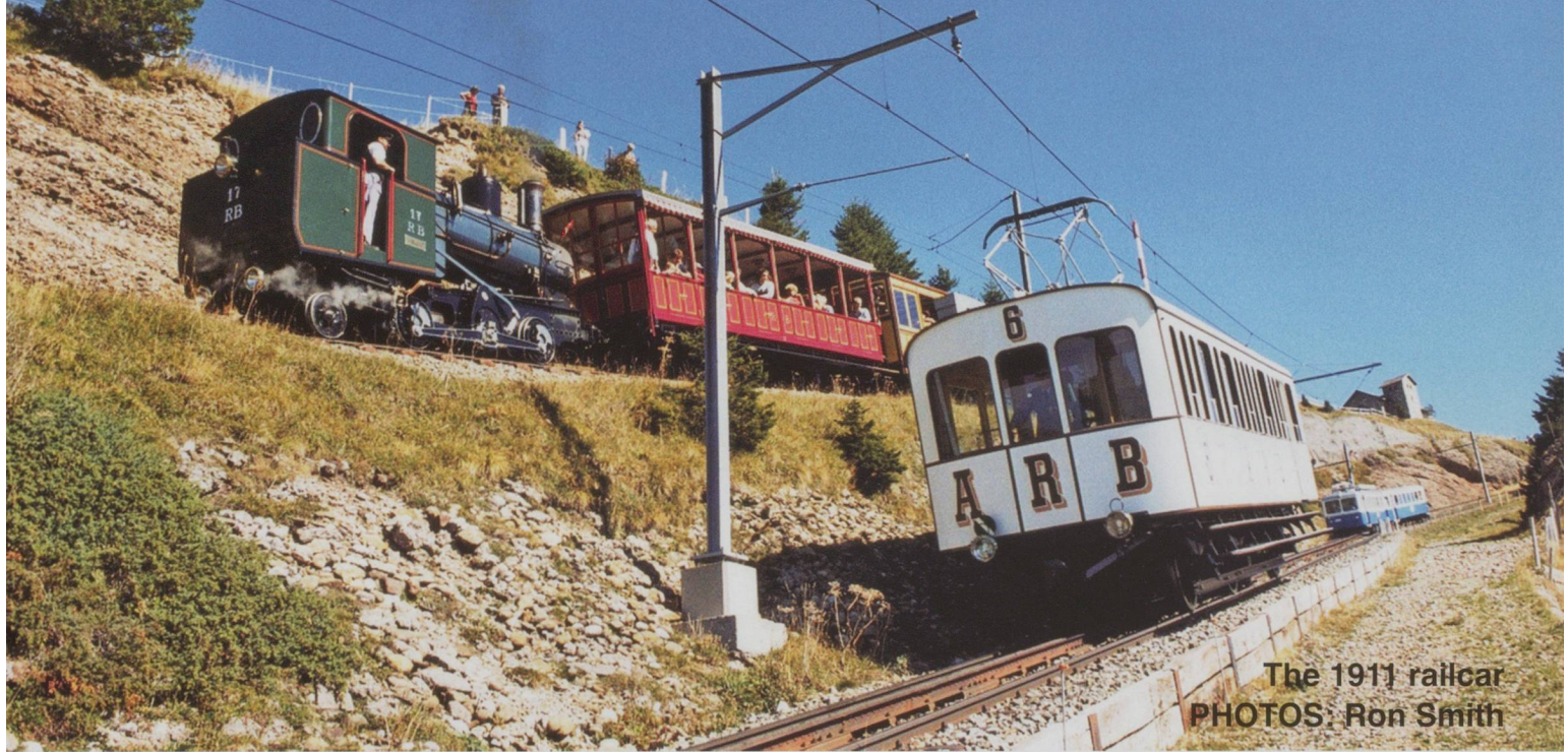
The 1911 railcar