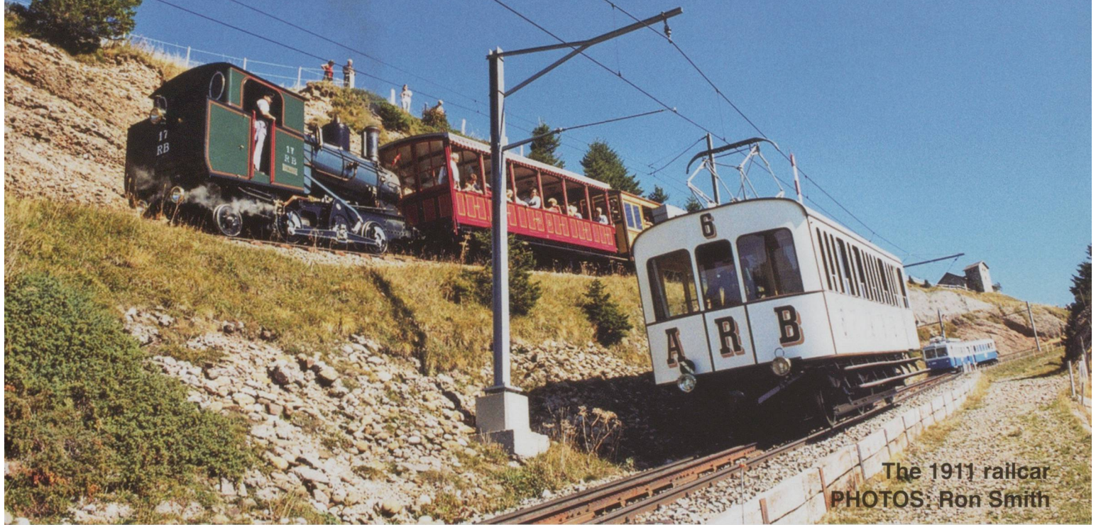
The 1911 railcar