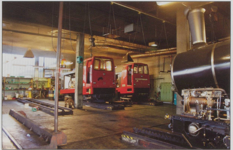
TOP: BRB loco No 6 inside the Brienz shed.