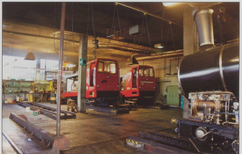
TOP: BRB loco No 6 inside the Brienz shed.