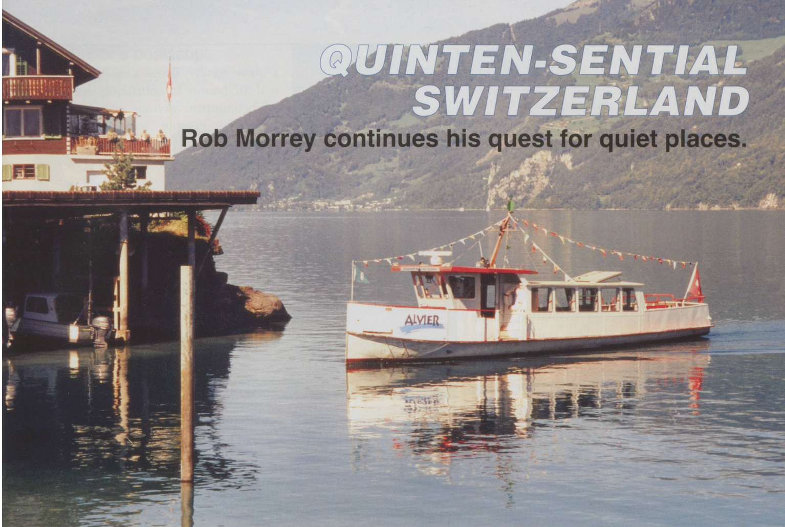
MS Alvier arrives at Murg West.