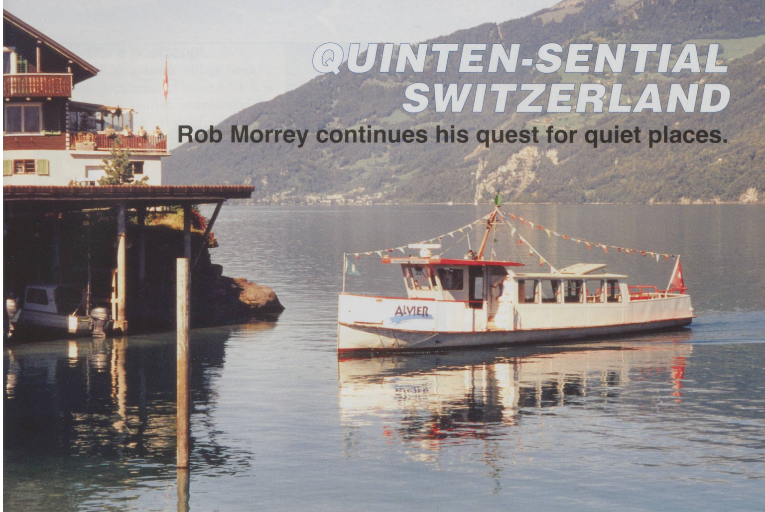
MS Alvier arrives at Murg West.