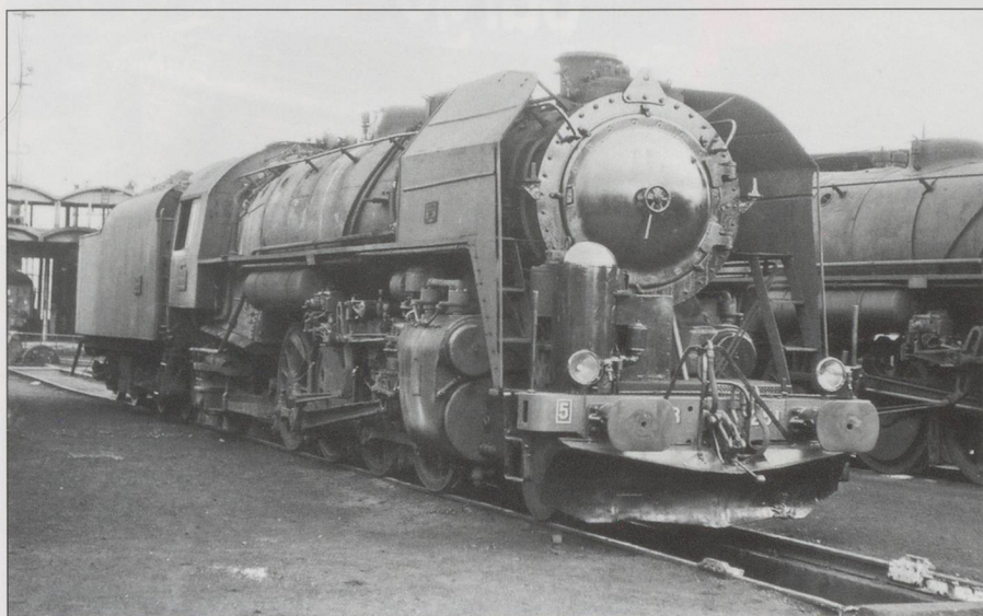
Sister locomotive 141R 251 at Dole shed, in the 1960's served the Belfort and Pontarlierservices.