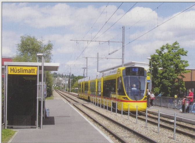
Pre-production BLT Tango in 2010.

After two years of proving trials, the delivery to Baselland Transport (BLT) of new Tango Trams from Stadler began in mid July. No 155 is the first of a batch of 15 in the first series order. BLT has said that although various adaptations were needed, the four prototypes have never suffered a serious breakdown. Compared to the 1970s design of the main fleet of trams, the Tangos have a 29% lower specific power consumption, partly due to regenerative braking that feeds the catenary with current generated by electric braking.