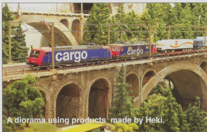
A diorama using products made by Heki.

T here are many good things happening in the railway modelling hobby right now. It is a very good time to start modelling Swiss railways in a number of scales and gauges. This article lists just a few of them.