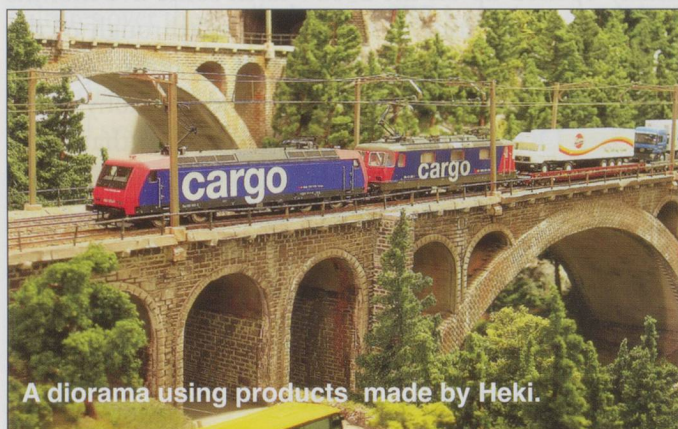
A diorama using products made by Heki.

T here are many good things happening in the railway modelling hobby right now. It is a very good time to start modelling Swiss railways in a number of scales and gauges. This article lists just a few of them.