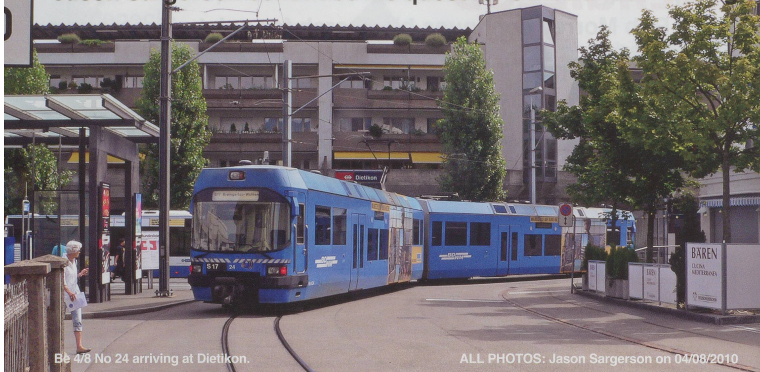
Be 4/8 No 24 arriving at Dietikon.