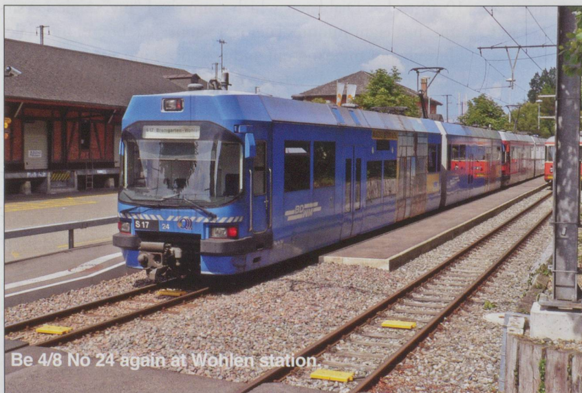
Be 4/8 No 24 again at Wohlen station

The BDWM is electrified at 1200V dc and until very recently its stock was of three generations, all in different liveries.