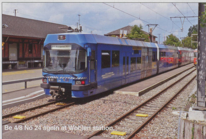
Be 4/8 No 24 again at Wohlen station

The BDWM is electrified at 1200V dc and until very recently its stock was of three generations, all in different liveries.